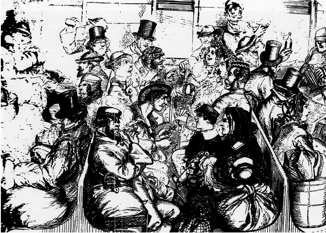
Sketch made in 1859 of a Parliamentary train from London to the Midlands.